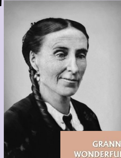
GRANNY'S WONDERFUL CHAIR