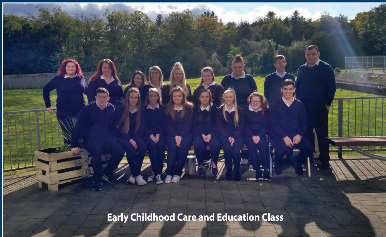
Early Childhood Care and Education Class