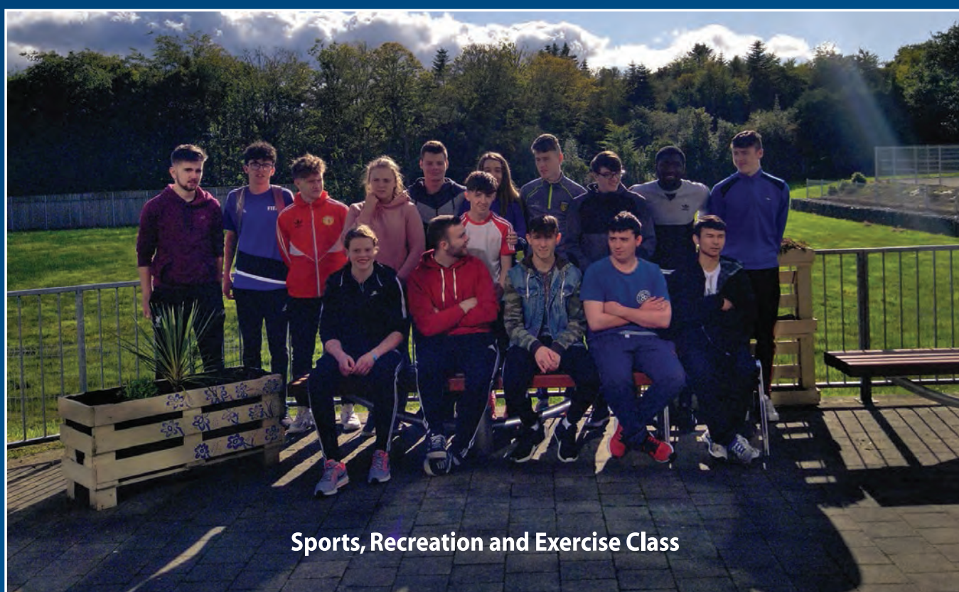
Sports, Recreation and Exercise Class