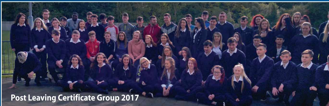
Post Leaving Certificate Group 2017

"Doing PLC was the best decision I ever made as it was a stepping stone to gaining full time employment. I obtained skills and knowledge that I still use to this very day. The tutors were excellent; they empowered students to use their own initiative and release their inner skills"