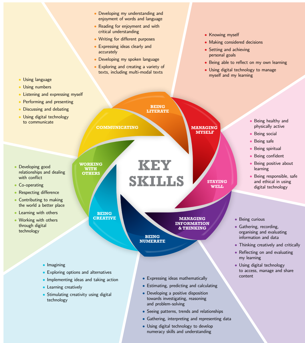
Figure 1: Key skills of junior cycle